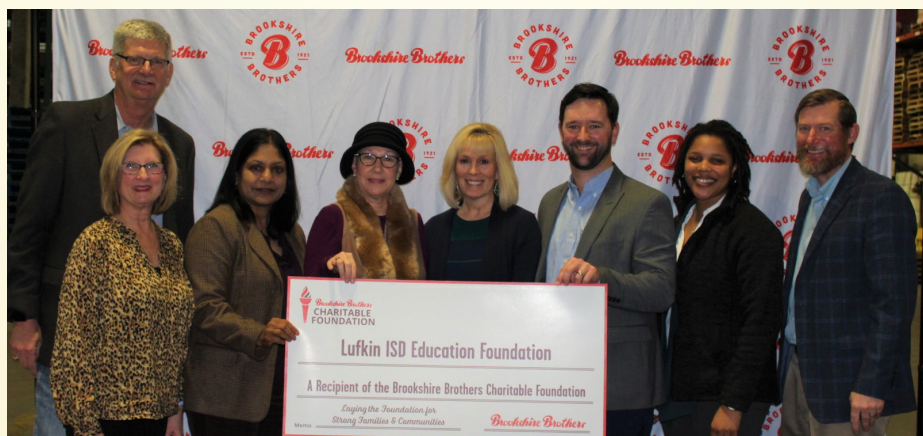
Representatives from the Brookshire Brothers Charitable Foundation presented a donation to members of the Lufkin Education Foundation board.