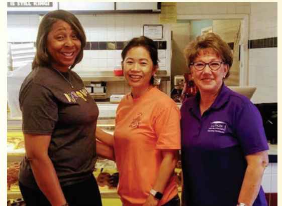
We are thankful to our community partner in trade, Donut Palace, for providing the delicious treats for our Donuts for Donors campaign.