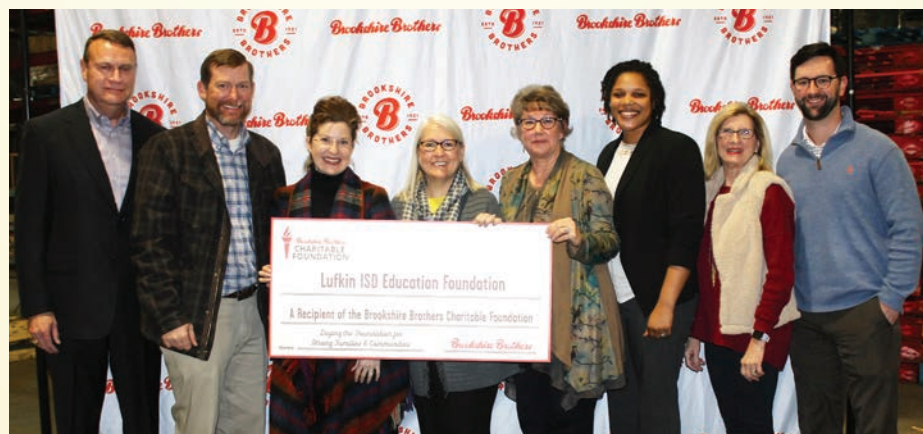
Representatives from the Brookshire Brothers Charitable Foundation presented a donation to members of the Education Foundation board.